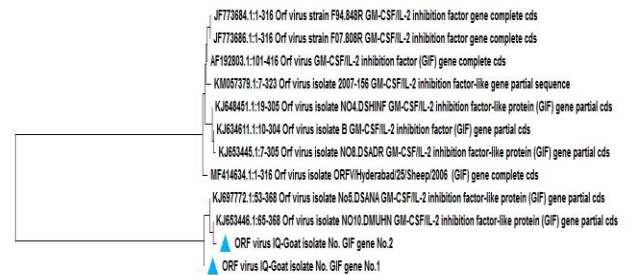
Figure 4: Phylogenetic tree analysis based on GIF gene partial sequence in local ORFV IQ-Goat isolate.1 isolates that was run for genetic relationship documentation. The phylogenetic map was made by unweight Pair Group way with Arithmetic Mean (UPGMA tree) in MEGA 6.0 version. The native ORFV IQ-Goat Isolate No. 1- No.2 were indicated closed related to NCBI-BLAST ORFV isolate No5.DSANA GM-CSF/IL-2 and ORFV isolate NO10.DMUHN GM-CSF KJ697772.1 and KJ653446.1 respectively at total genetic changes 0.0005-0.0015%.

The local isolates presented only a 0.66-0.95% variance from the Iraqi Orf references virus strains detected in 2015 (Figure 4). Phylogenetics analysis based on the partial GIF genes (Figure 4) indicated that Iraqi strains were closely related to the Iraqi types; with which it has progressed from a communal progenitor.