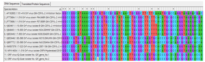
Figure 3: Multiple sequence arrangement analysis of GIF gene in local ORFV IQ-Goat isolate and NCBI-Genbank in local ORFV IQ-Goat isolate. The multiple alignment analysis was created using ClustalW alignment implement in MEGA 6.0 version. That show the nucleotide alignment likeness as (*) with substitution mutations in GIF gene.

Built on analysis of the sequence of the GIF gene, the Iraqi goat orf virus strain exhibited 99.05% of character at the nucleotide range with the Iraqi sheep Orf virus KJ697772.1 and the second Iraqi goat ORFV strain display 99.34% identity at the nucleotide level with the other strain of Iraqi sheep ORFV KJ653446.1 as in table 2.